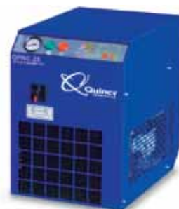
Quincy Non-cycling Refrigerated Dryer