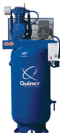
Magnetic Starter 271CS80VCB (QT)