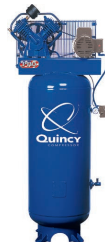
Capacitor Start Motor 2V41C60VC (QT)