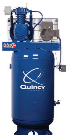
Combo Pressure Switch/Starter 251CP80VCB (QT)