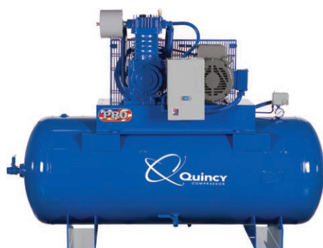
Magnetic Starter P2103DS12HCB (QT)