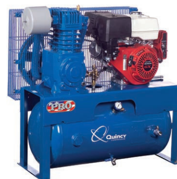
13 HP Honda Gas Engine G213H30HCB (QT)