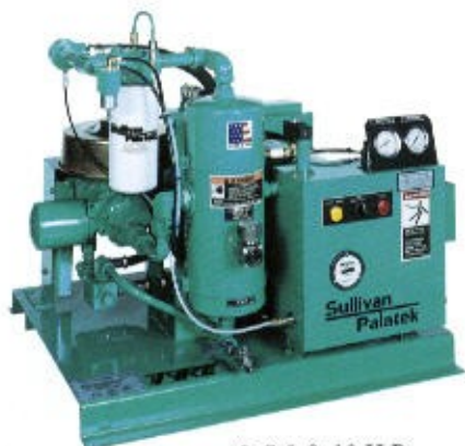
5, 7.5 & 10 H.P.