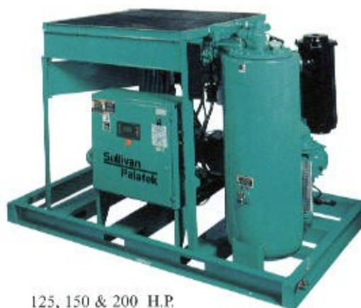
125, 150 & 200 H.P.