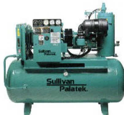
15 & 40 H.P.