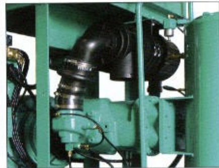
40 - 50 H.P. shown

One piece housing for dependable performance and full modulation.