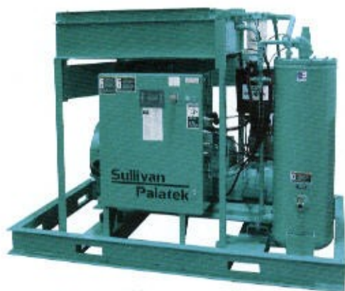
75 & 100 H.P.