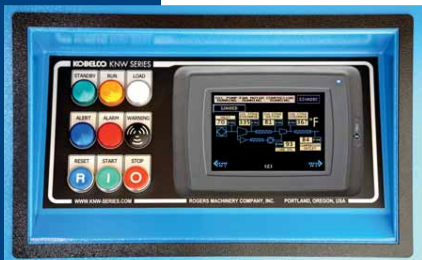
Temperature page shown on touchscreen.