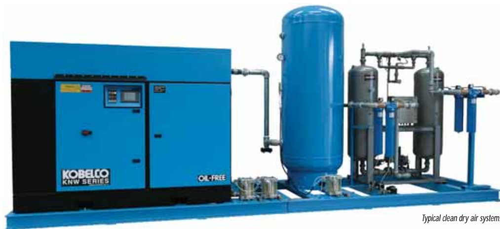
Typical clean dry air system.

To meet the demands and preferences of a wide range of customers and industries, we offer custom packaging of compressors, dryers, filters and receivers. From the simple package shown to projects requiring stainless steel welded pipe, Nema 7 controls, or outdoor weather protection, we can supply it. Packaging greatly reduces on site installation costs and the equipment is tested together.