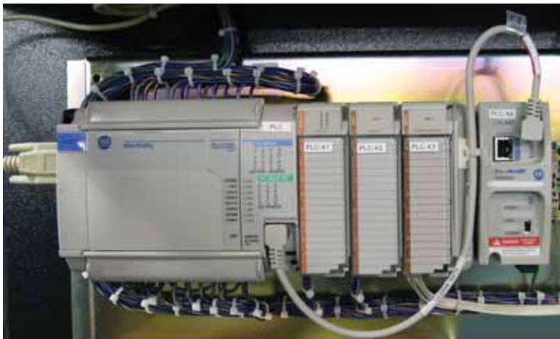
Standard Allen-Bradley PLC. Built in sequencing capability—up to four compressors. Interfacing with plant monitoring systems easily accomplished (optional). (Optional Allen Bradley Ethernet Communication module shown.) PLC manufacturers of customer preference can also be utilized at additional cost.

capacity loss during the life of the unit. A separate motor driven oil pump ensures positive lubrication of all gears and bearings prior to start-up, maximizing component life.