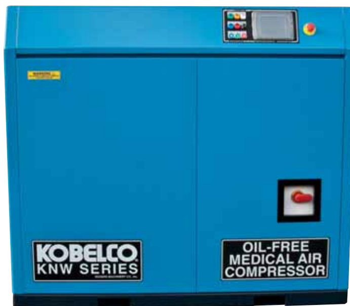
Air-cooled medical air compressor.